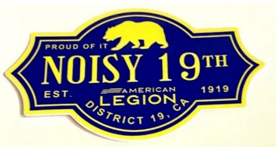
Noisy 19 th Sticker

The sticker is 3.00 inches wide, with yellow and blue colors on an adhesive back.