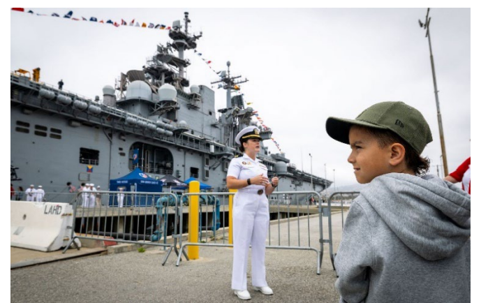
A young visitor meets a Navy officer alongside an active-duty ship at the Port of Los Angeles.

SAN PEDRO, CA — The Los Angeles Waterfront surged with patriotic energy over Memorial Day Weekend as the 10th annual LA Fleet Week drew thousands of visitors to the Port of Los Angeles.