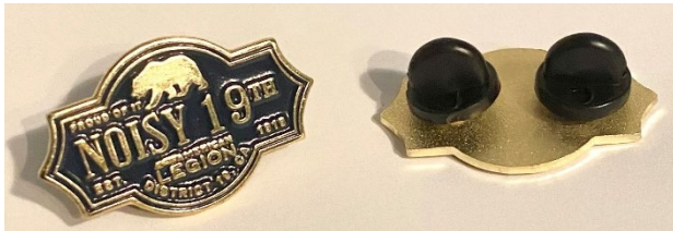
Noisy 19th Pin Front and Back

The pin is approximately 1 ¼ inches wide. Made of polished brass, with a dark blue background color. The pin has a double rubber clutch on the back and won't stain your cover or suit lapel.