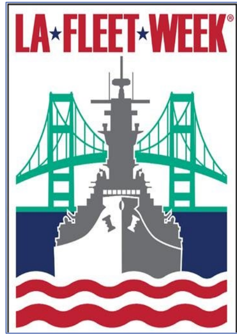
LA Fleet Week® is Memorial Day Weekend with Festival & Ship Tours: 22-25 May 2026