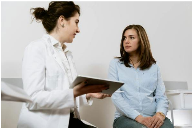
Doctor talking to patient.

Support has also come from Veteran advocacy groups, including Iraq and Afghanistan Veterans of America and Disabled American Veterans. These organizations have raised concerns about gaps in treatment options, especially for PTSD, depression, and traumatic brain injuries, or TBI.