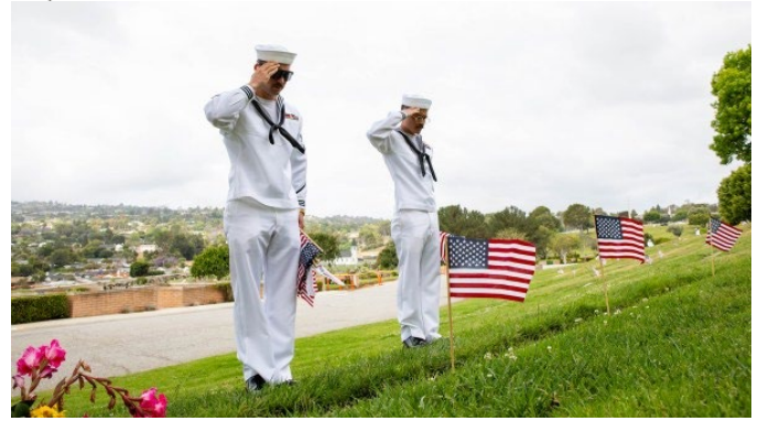
Green Hills Memorial Park, 2025