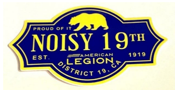
Noisy 19th Sticker

The sticker is 3.00 inches wide, with yellow and blue colors on an adhesive back.