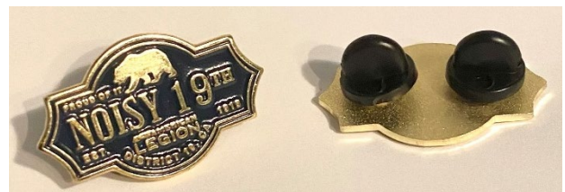
Noisy 19th Pin Front and Back

The pin is approximately 1 ¼ inches wide. Made of polished brass, with a dark blue background color. The pin has a double rubber clutch on the back and won't stain your cover or suit lapel.